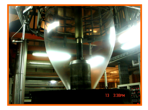
BLOWN-FILM EXTRUSION PROCESS

Our film fully meets the overall migration requirements and is therefore suitable for direct food contact.