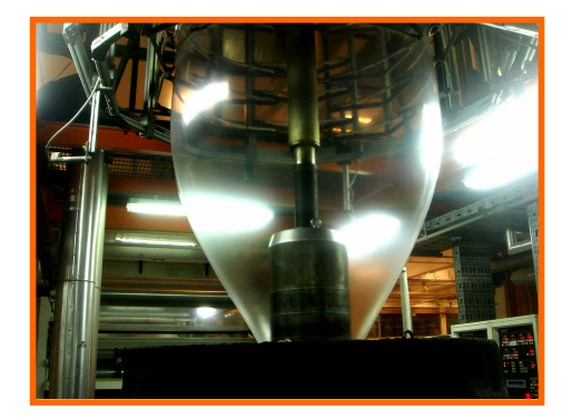
BLOWN-FILM EXTRUSION PROCESS

Our film fully meets the overall migration requirements and is therefore suitable for direct food contact.