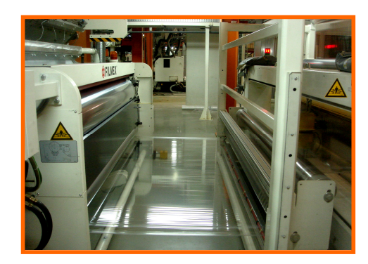
CAST FILM EXTRUSION PROCESS

Our film fully meets the overall migration requirements and is therefore suitable for direct food contact.