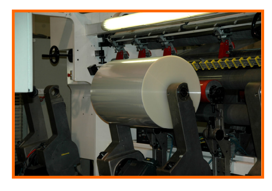
CPP NORMAL GRADE FILM