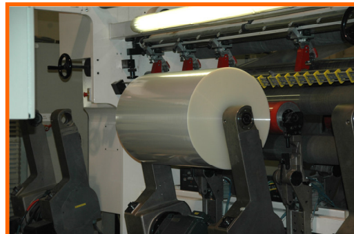
CPP METALLIZABLE GRADE FILM