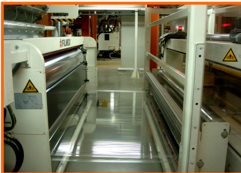
CAST FILM EXTRUSION PROCESS

Our film fully meets the overall migration requirements and is therefore suitable for direct food contact.