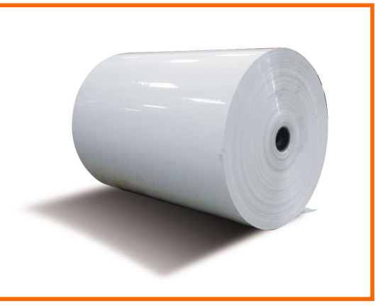
PE WHITE LAMINATION GRADE FILM