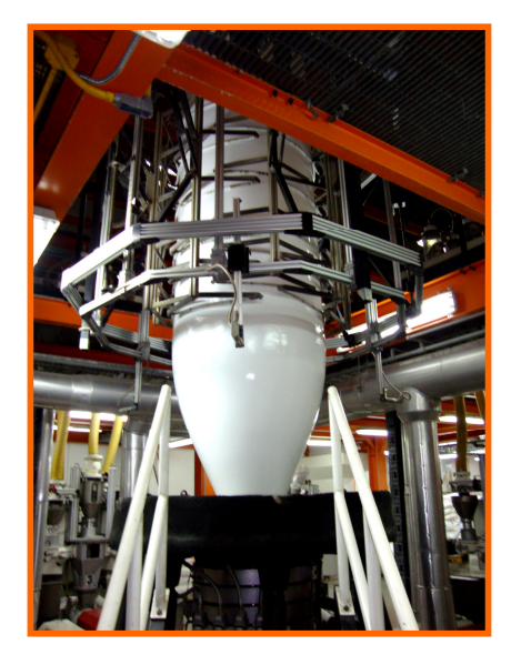
BLOWN-FILM EXTRUSION PROCESS

Our film fully meets the overall migration requirements and is therefore suitable for direct food contact.